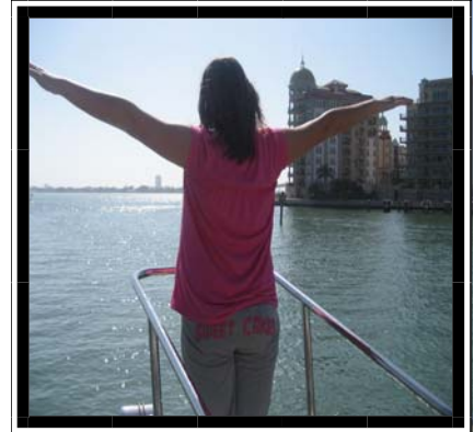
Loving the Ride on Sarasota Bay